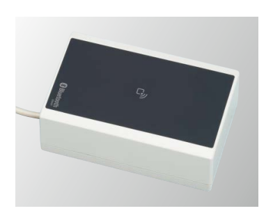
BLE encoder (for Mobile) W105mm×H65mm×D40.2mm

Miwa App available, Apple App store & Google play.